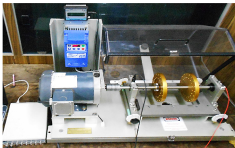
Fig. 1. Experimental setup for two plane rotor system

The experimental setup used in this study is shown in Fig. 1. This apparatus is driven by a 3-HP induction motor with a speed range between 20 and 3000 rpm. The shaft rotation speed can be controlled by a speed controller.