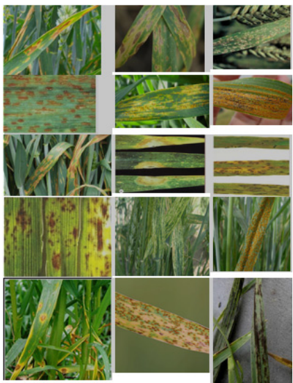
Fig. 1. Leaves images of wheat in various diseases. 1 – Septoria Leaf Spot (Septoria), 2 – pirenoforoz (Pyrenophora tritici-repentis), 3 – Powdery mildew (Erysiphe graminis), 4 – brown rust (Puccinia recondita), 5, 6 – yellow rust (Puccinia striiformis), 7 – leaves Septoria Leaf Spot (Septoria tritici), 8 – Snow mold (Fusarium nivale), 9 – blotch (Helminthosporium sativum), 10 – Root rot, 11 – Stripe Mosaic (Wheat streake mosaic virus), 12 – Brown (sheet), rust (Fungal diseases (Puccinia triticina)), 13 – blotch (Pyrenophora tritici-repentis), 14 – Linear (stem) rust (Puccinia graminis), 15 – Head smut (Ustilago tritica)