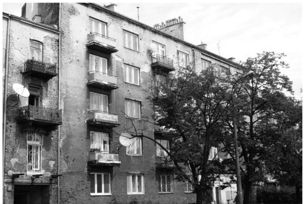
Fig. 1. View of the eastern facade of the building

Floors were made as Klein type. It is located 9 m from the edge of the road and about 20 m from the tram line (distance measured from the nearest rail head) and located directly above the metro tunnel.