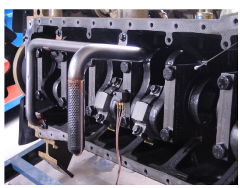
Fig. 1. Installation position of vibration sensor