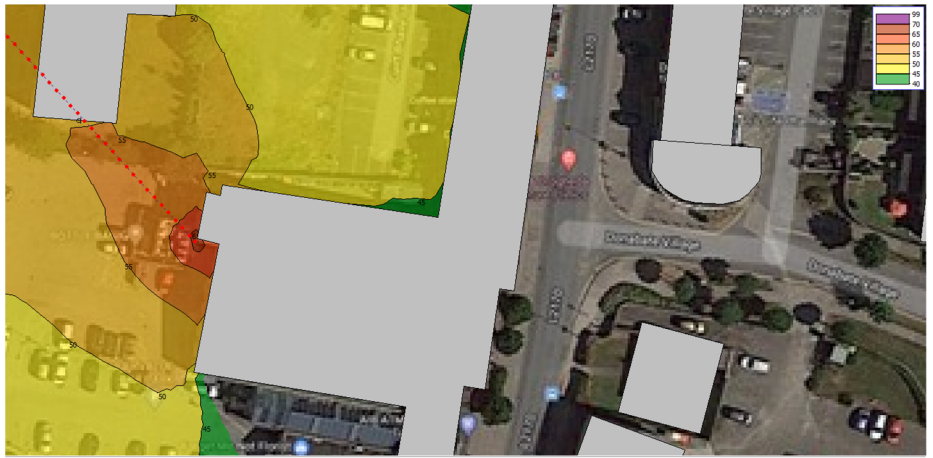
Fig. 3. FP2, velocity 1 Km/Hr, 200 daytime flights