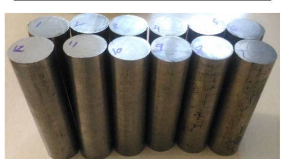
Fig. 1. Workpiece Material AISI 316