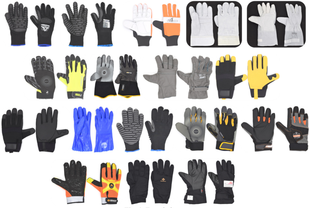
Fig. 1. Tested gloves

Due to the interests of manufacturers, the article uses the numbers assigned to them for testing purposes instead of the names of the gloves. There are also illustrative photos that do not allow for unequivocal identification of the presented products.