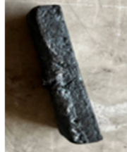
Fig. 1. Cast sample. Photo by B. Ibrohimov in the Metals Technologies Laboratory on January 8, 2025

After casting, the samples were removed from the molds and mechanically machined for hardness testing. The hardness was measured using an HXS-1000Z hardness tester [18].